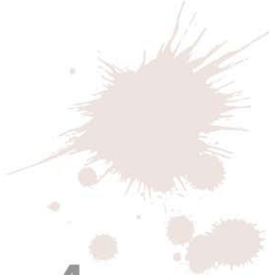
4 Benjamin Moore Muave Hint 878