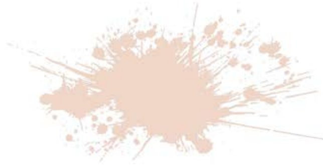
2 Farrow and Ball Pink Ground No. 202