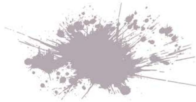
7 Benjamin Moore Sanctuary AF-620