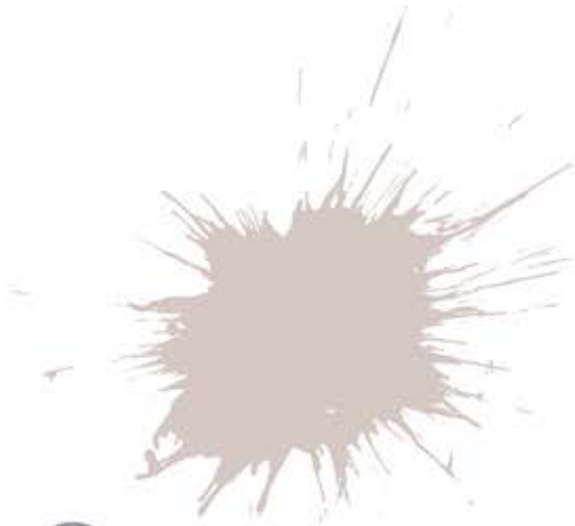
3 Farrow and Ball Peignoir No. 286