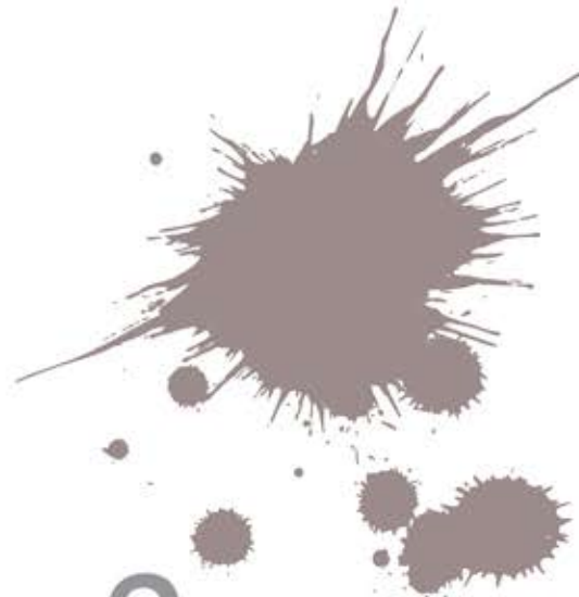
9 Valspar Lilac Gray 1003-93