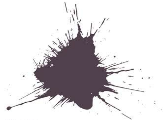
10 Farrow and Ball Pelt No. 254