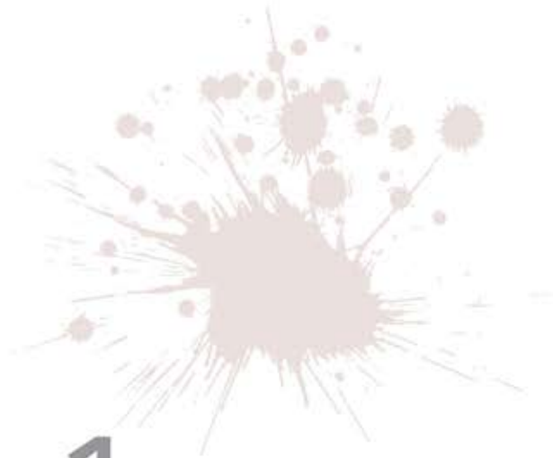
1 Valspar Ballet Slippers CI214