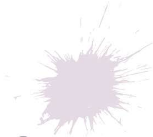
8 Sherwin Williams Spangle SW 6834